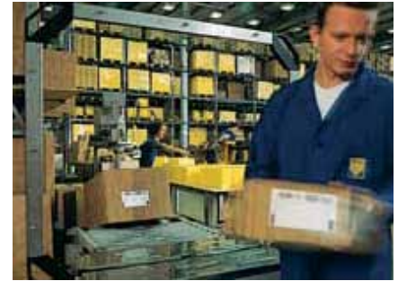
Manual Postal sorting